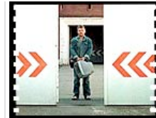
New world

Schattel and director of photography Steve Agnew, shooting in 35mm, have created a good-looking, low-budget film with a rusted-out palette that accurately captures the protagonist's state and matches the story's country-noir tone.